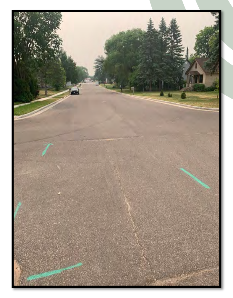
County K – City of Spooner