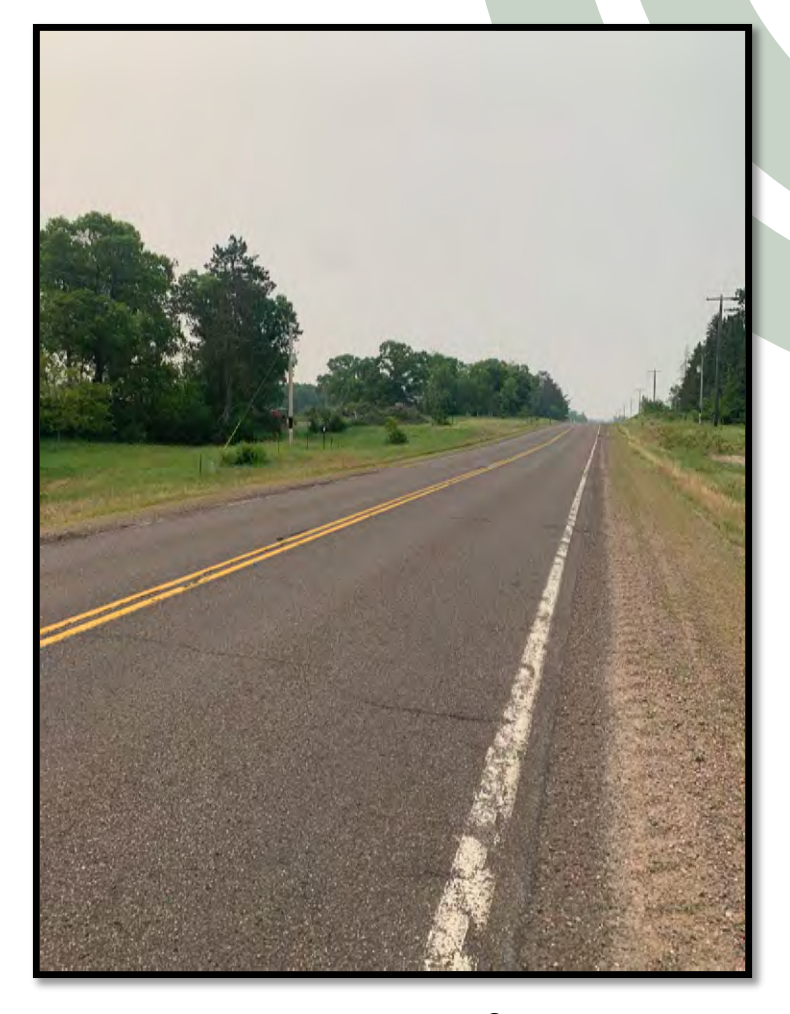
County K – Town of Spooner