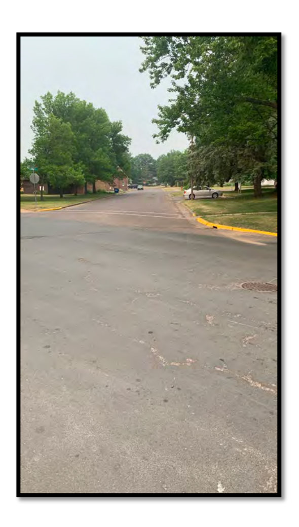
Excessively wide intersections