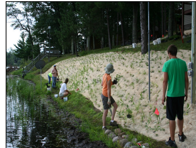
Restoring a steep mowed lawn to natural vegetation